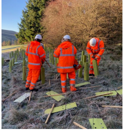
Habitat creation & enhancement

• Ongoing habitat management advice, monitoring and reporting